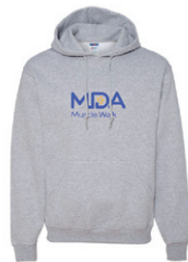
Hooded Sweat Shirt