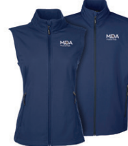
Soft Shell Vest