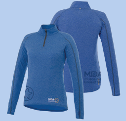
Circle of Strength - $1,000

MDA's Circle of Strength is an exclusive group of participants who go above and beyond in their fundraising efforts. This is an additional thank you along with your incentive gift.