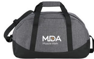
Graphite Duffel Bag