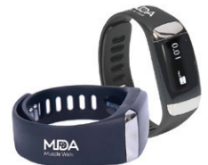
Active Health Tracker With Heart Monitor