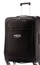
21" Spinner Suitcase American Tourister iLITE MAX