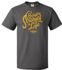
2017 Muscle Walk Participant T-Shirt