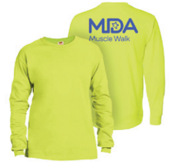
Long Sleeve Tee