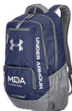
Under Armour Backpack